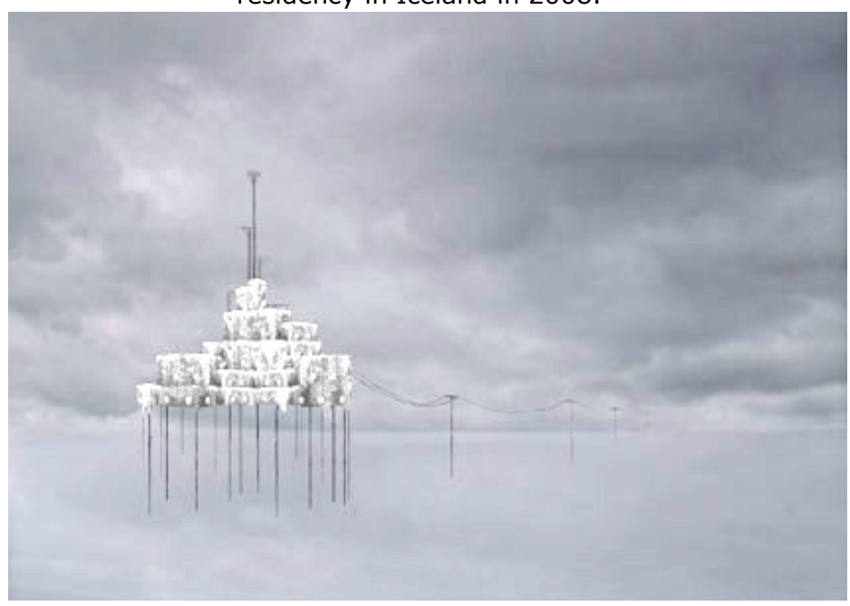
Baltic Wanderer, 2011 Hocken Collections Uare Taoka o Hakena, University of Otago

Baltic Wanderer, 2011 is a digital animation work, the result of an artist's residency in Iceland in 2008.