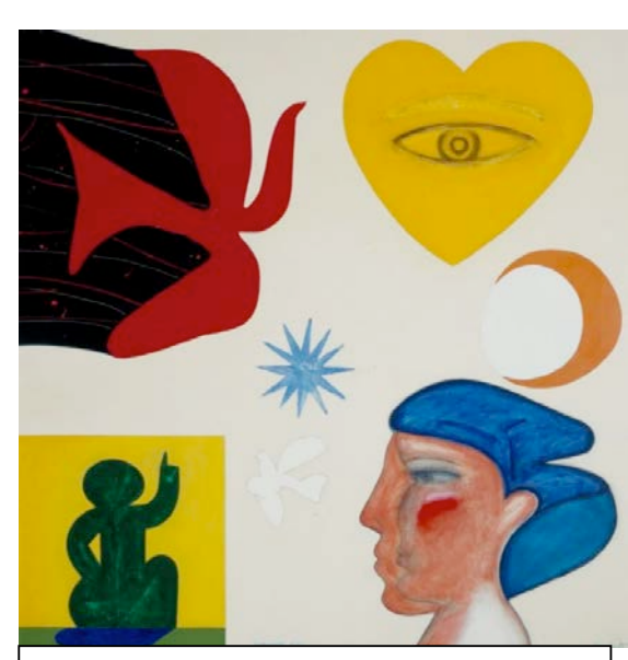
Wonder Full, 1983, Chartwell Collection, Auckland Art Gallery, Toi o Tamaki

Many of these symbols have become iconic including the: dove, boat, eye, child/tiki figure, crescent moon, heart, tree