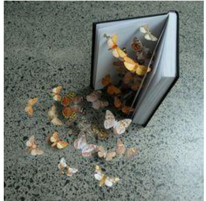
Butterfly Book 2007 Found object and collage Private Collection