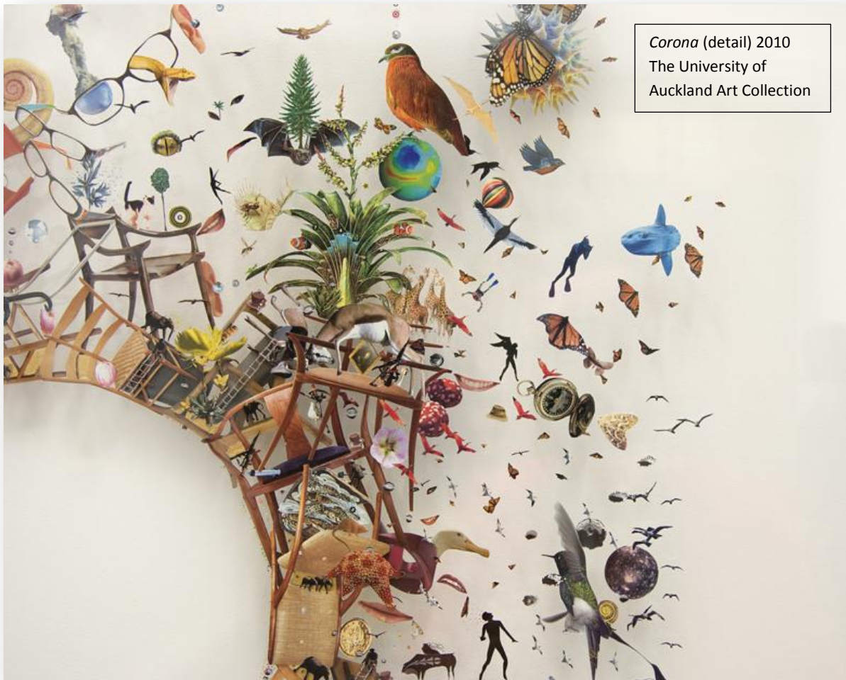
Corona (detail) 2010 The University of Auckland Art Collection

‘Coming from all the places you have never been’