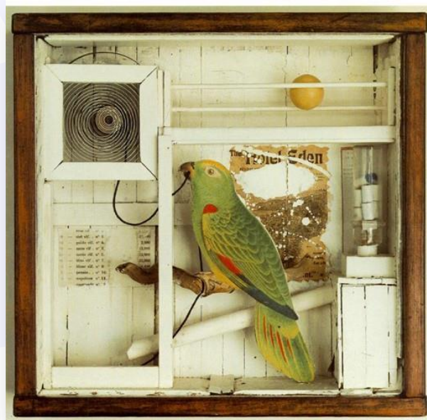
Joseph Cornell, The Hotel Eden , 1945