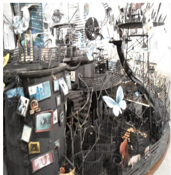
The Unbuilt Realm of Indeterminapolis, 2003 Found objects and mixed media Collection of The James Wallace Arts Trust

Preoccupations about life, death and notions of truth aside - Madden also infuses his work with poetry and humour and a sense of the 'delightful' and 'whimsical'. Children especially are captivated by the black miniature cityscape mounted on a black table in the middle of the gallery. It is called The Unbuilt Realm of Indeterminapolis , an imaginary complex fantasy world drawing upon photographs of the real world to recreate dreams, nightmares and histories of past civilisations (regular features of National Geographic magazines) with a touch of gothic fairyland. Children can identify with the feeling that the city could come alive at night. Madden has commented that creating cityscapes or dioramas made him feel like a writer developing a novel. Most of his works contain 'untold' stories and children are able to let their own imaginations take over while viewing all the objects.