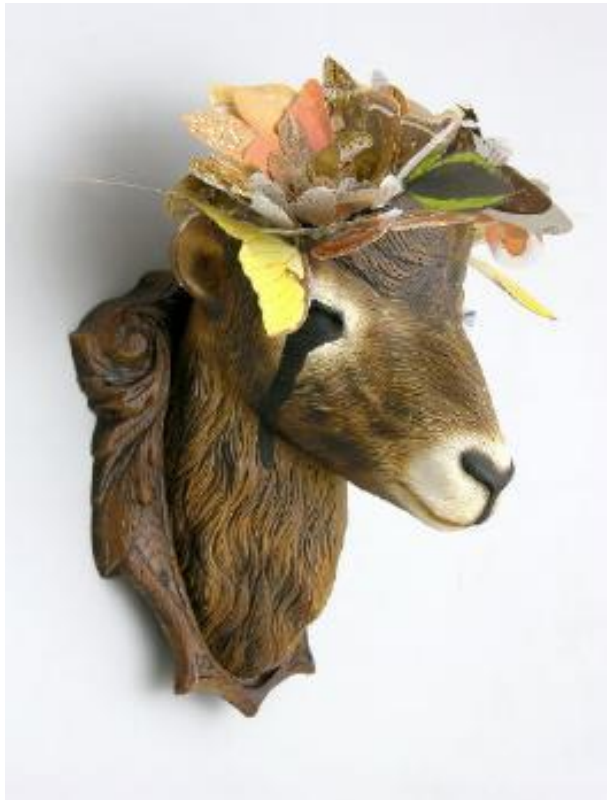
Ram Mount 2004

Found object and found images Chartwell Collection, Auckland Art Gallery Toi o Tamaki, 2004