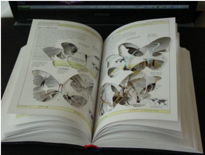
Butterfly Book (aka The Missing) 2007 Found object and found images Collection of The James Wallace Arts Trust