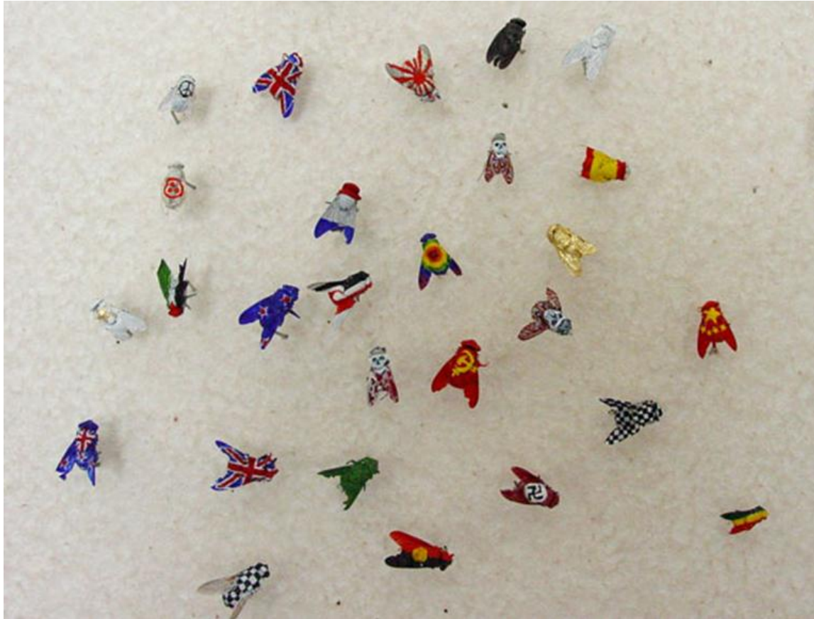
Assorted flies from Lord of the Flies installation 2012 - 2014 dead flies, gesso, watercolour & resin Collection of the artist.