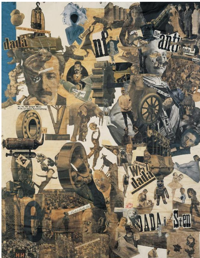
Hannah Höch, Cut with the Kitchen Knife through the Beer-Belly of the Weimar Republic 1919 Collage of pasted papers Berlin Museum