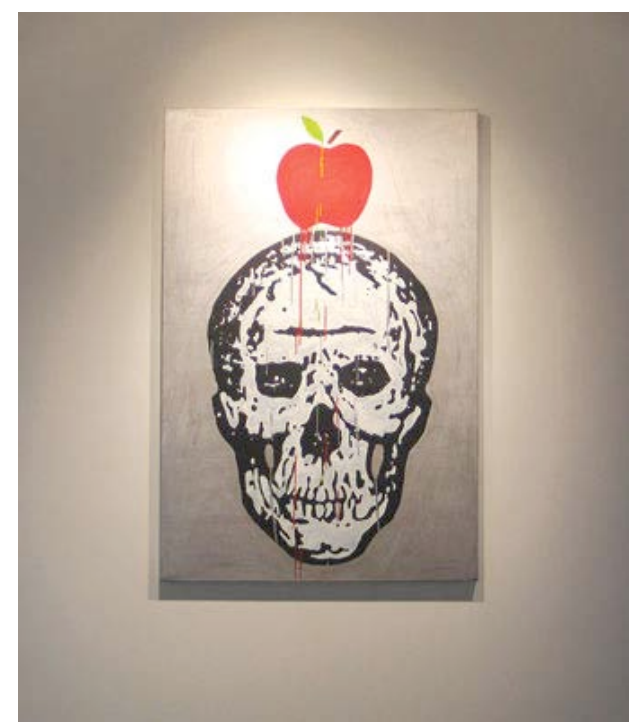
Wayne Youle, Stay still, don't move 2007

An artist who enjoys exploring new technologies and materials Youle's body of work includes three dimensional objects, installation, drawing, sculpture, photography, painting and tattooing.