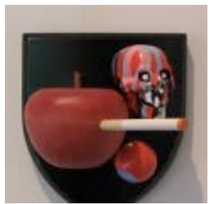
Wayne Youle, Youle family coat of arms