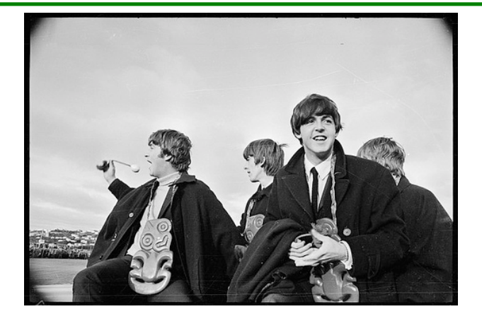
The Beatles arrive in Wellington New Zealand, 1964.