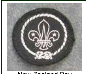
New Zealand Boy Scouts patch.

Signs and symbols are used by people to show identity. Youle has referred to tattooing, recreated his family crest in three dimensional objects and explored many diverse and familiar symbols used to represent New Zealanders. This journey of signs and symbols has taken him from Boy Scout badges, gang patches, and hei-tiki, to a contour map of Aotearoa.